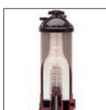
Star Clear™ filter cross section