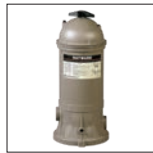
D.E. recovery tank C09002SEP