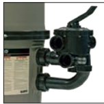
6-position valve sold separately SP0715XR50E