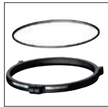
The Hayward® filter clamp assembly consists of two key components that work together with the clamp