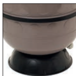
Circular base for perfect filter stability