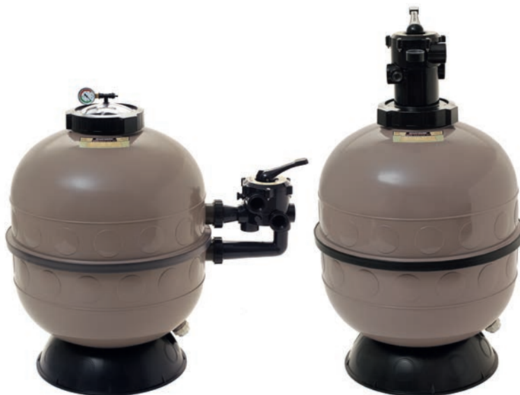
ProSeries™ HI Side