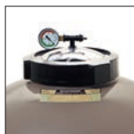
180 mm diameter threaded opening for simpler maintenance operations